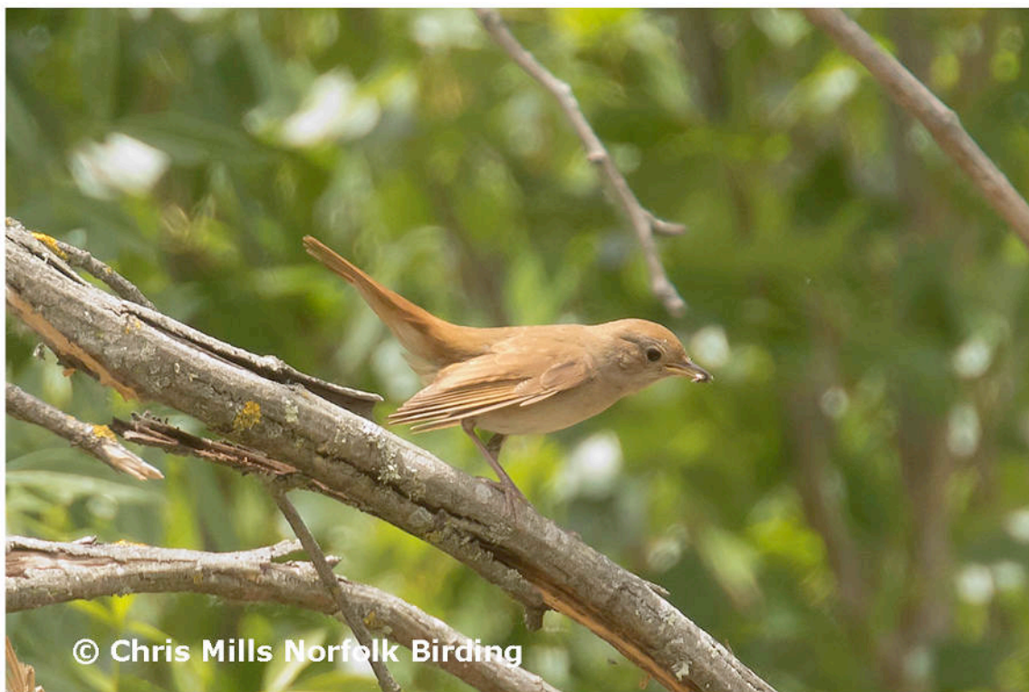
Little Owl & Nightingale, the latter being extremely numerous!