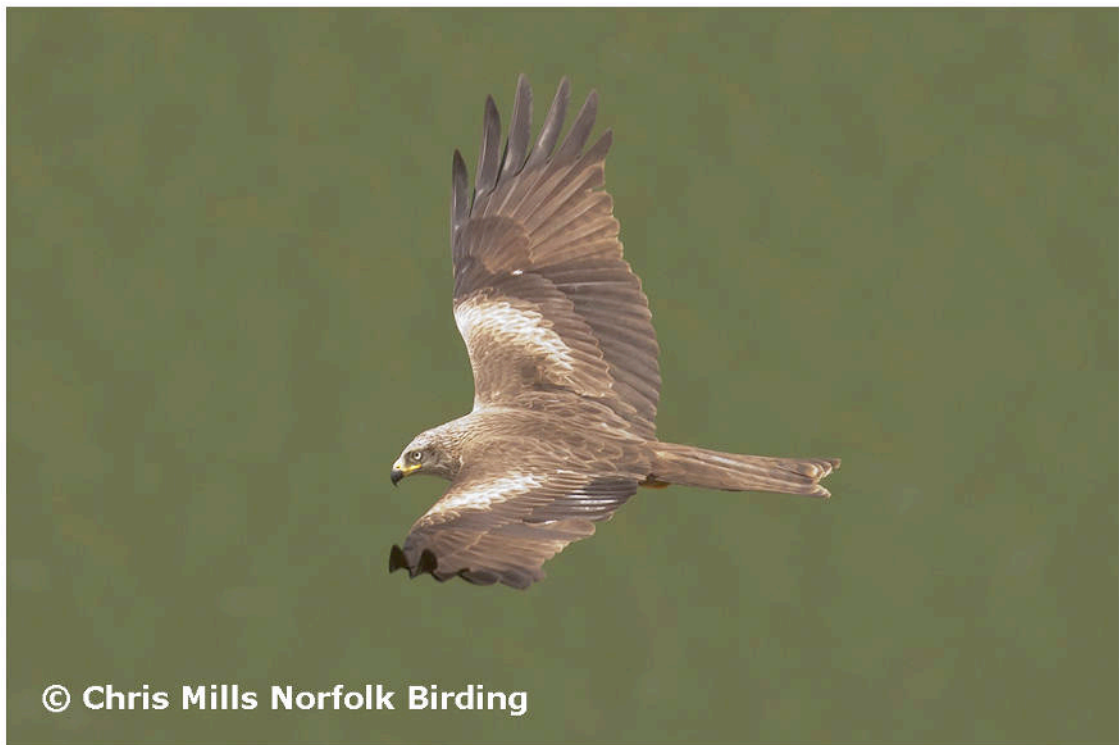
Bee-eater & Black Kite – both seen on a daily basis