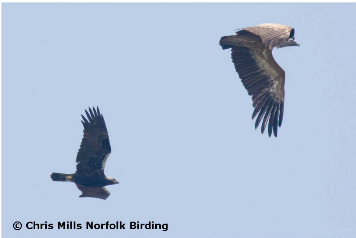
Spanish Imperial Eagle & pursuing Griffon Vulture, awesome views at Monfrague!