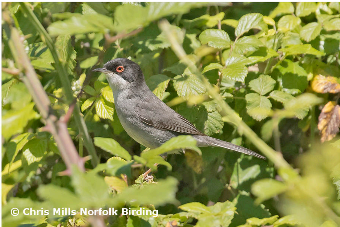
© Woodchat Shrike & Sardinian Warbler