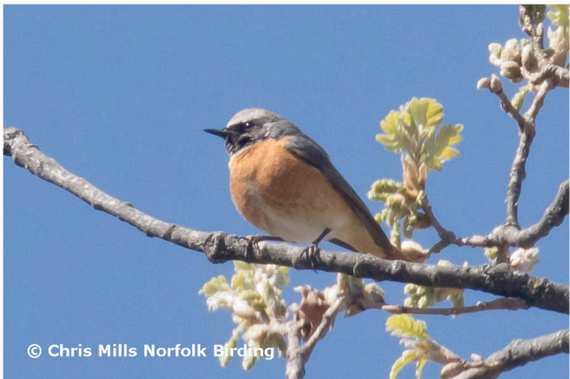
Iberian Pied Flycatcher & Common Redstart – higher up in the mountain forest