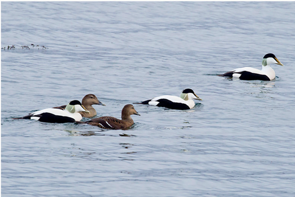
Above © Black Guillemot Tarbet harbour 2017– Chris Mills Below © Common Eider Islay 2017– Chris Mills