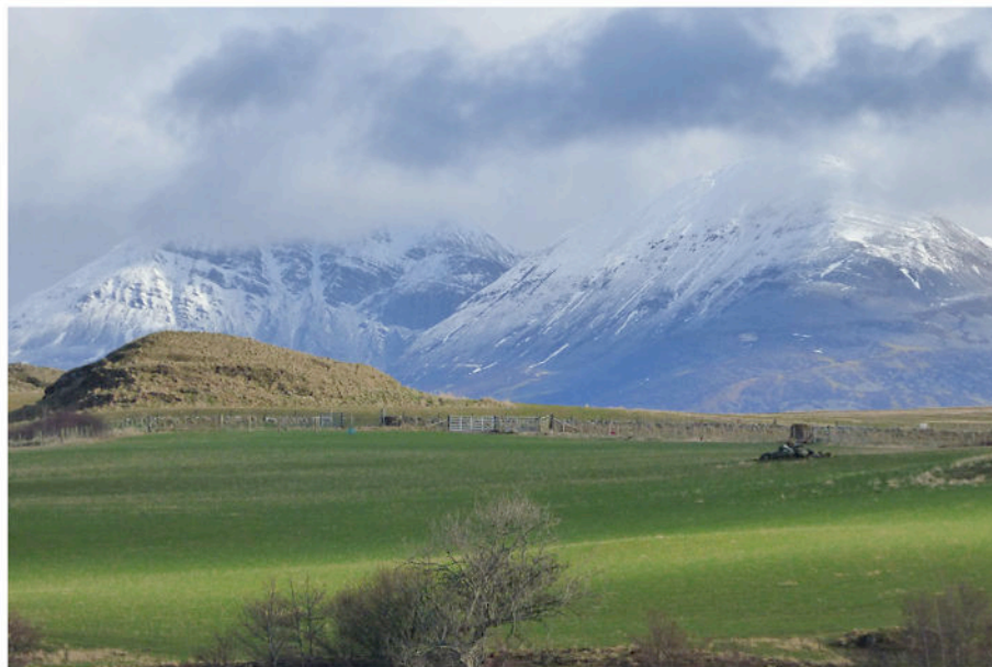
Above © Red Deer Tarbet harbour 2017– Philippa Randall Below © Paps of Jura 2017– Philippa Randall