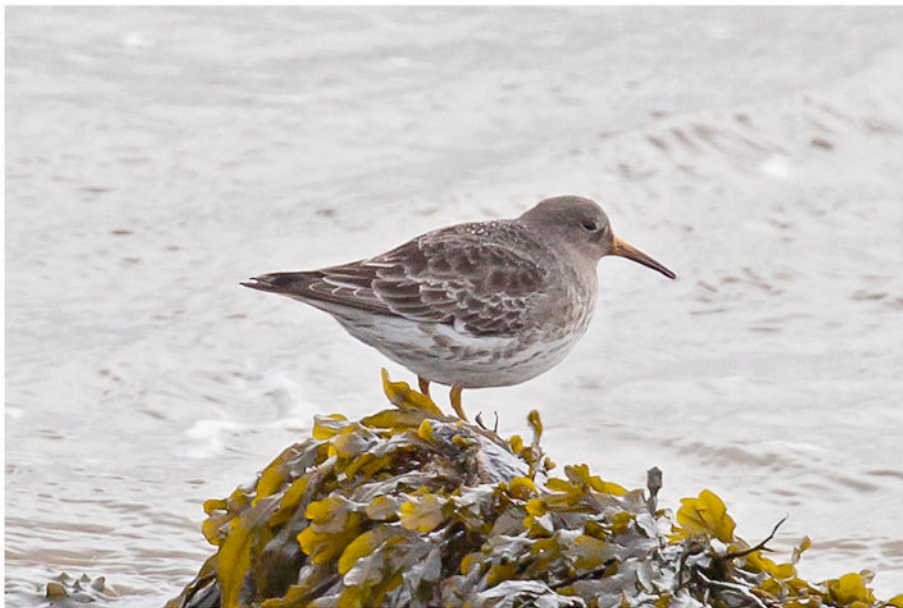
Above © Oystercatcher Tarbet harbour 2017– Chris Mills Below © Purple Sandpiper Islay 2017– Chris Mills