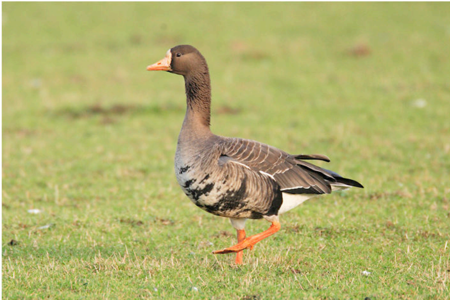
Above © Barnacle Geese adult & youngster Islay 2017– Chris Mills Below © Greenland White-fronted Goose Islay 2017– Chris Mills